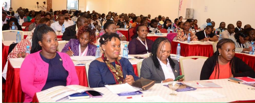
KPA Nairobi Branch members attentively following presentations in Branch Annual Scientific Conference