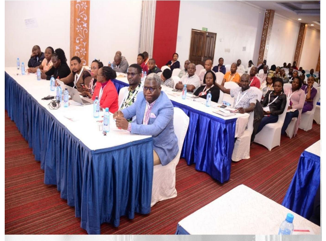
Kenya Pharmaceutical Association Nairobi Branch

KPA Nairobi Branch Scientific Conferences/Webinars /Meetings/Symposia/Medical Camps/Workshops are therefore the most prestigious professional pharmaceutical meetings in Nairobi bringing together professionals and business people in the pharmaceutical industry.