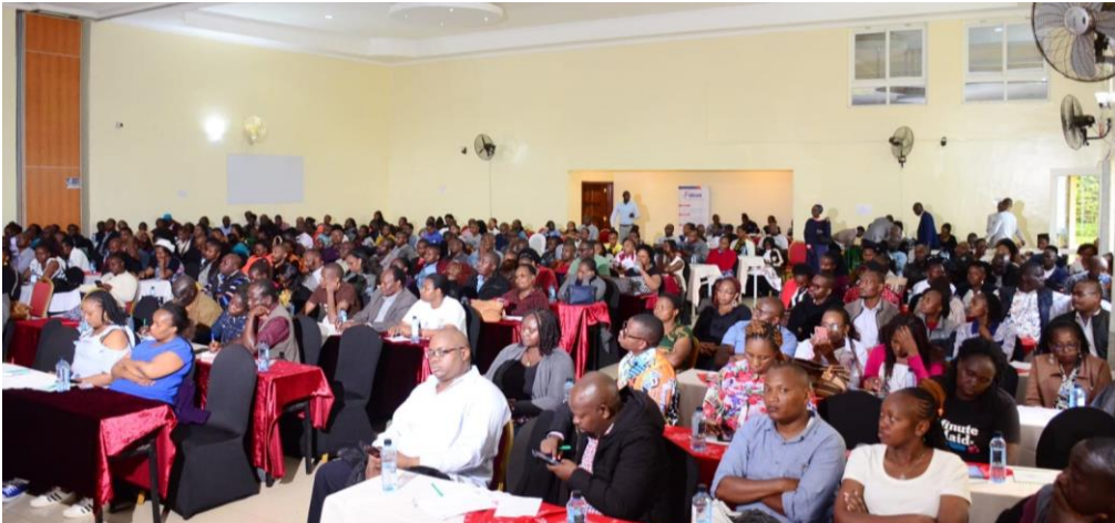
KPA Nairobi Branch members during Branch Bi-Monthly Scientific Meeting (BSM)