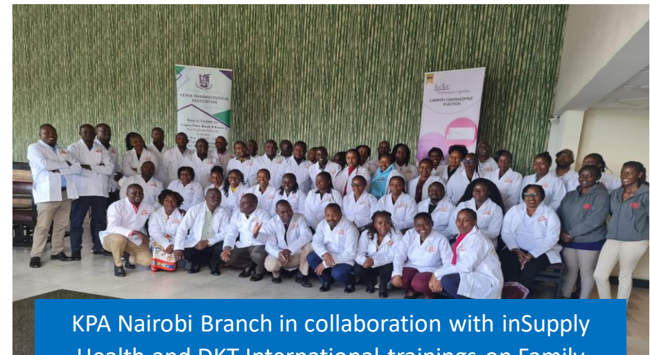
KPA Nairobi Branch in collaboration with inSupply Health and DKT International trainings on Family Planning and Self Care.