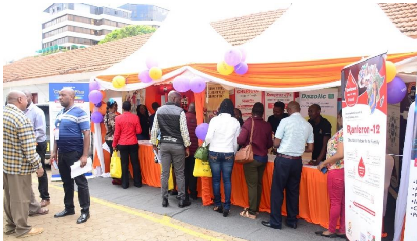
KPA Nairobi Branch members visiting exhibition booths during Branch Annual Scientific Conference