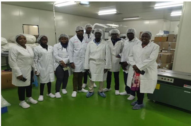
KPA Nairobi Branch Student Mentorship at Lab & Allied Pharmaceuticals.